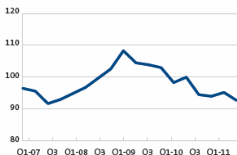
D&B Global Insolvency Index (Q2 2010=100)